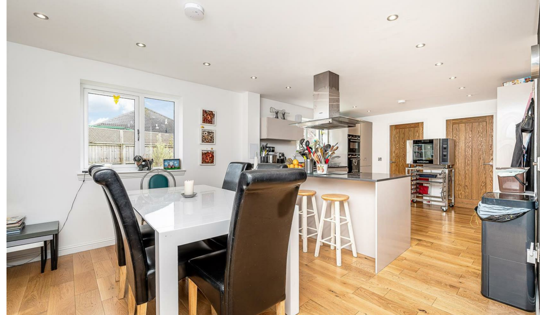
Beautifully presented executive detached villa situated in the ever popular West Fife village of Cairneyhill. This superb home built in 2021, is situated behind the main street with private driveway leading into the property. There is parking for several vehicles and lovely gardens to the rear with large patio area, an excellent home for entertaining. The grounds are well maintained, private and secluded providing a child and pet safe environment with the addition of generous outbuilding currently uses as an office/gym also with outdoor storage. The property is offered in move in condition with quality high specification fixtures and fittings throughout. The subjects briefly comprise entrance porch and hallway, open plan lounge leading to dining kitchen and utility, bedroom 5 and bathroom on the ground floor. On the upper level there are four further bedrooms with en-suite wc facilities and stylish shower room. Access to attic. The property is double glazed with air source heating and solar panels making this a very economical home to run. Essential viewing.